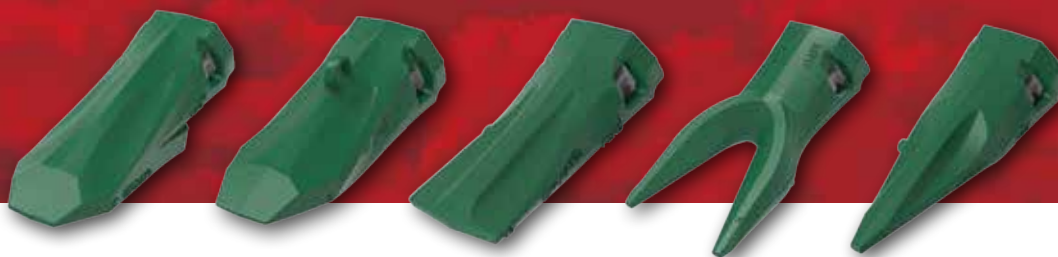
Ultralok® Tooth System