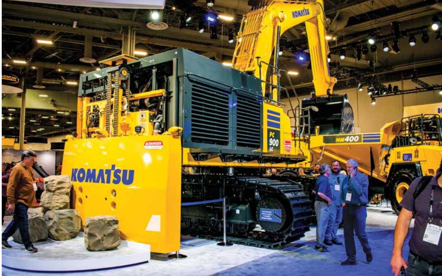
In addition to electric equipment, Komatsu showcased its new PC900LC-11 excavator, which was paired with a Komatsu HM400-5 articulated truck.

the PC01E electric micro excavator. Developed jointly with Honda, it is powered by portable and swappable mobile batteries. The new machine is designed for confined spaces in landscaping, agriculture and construction.