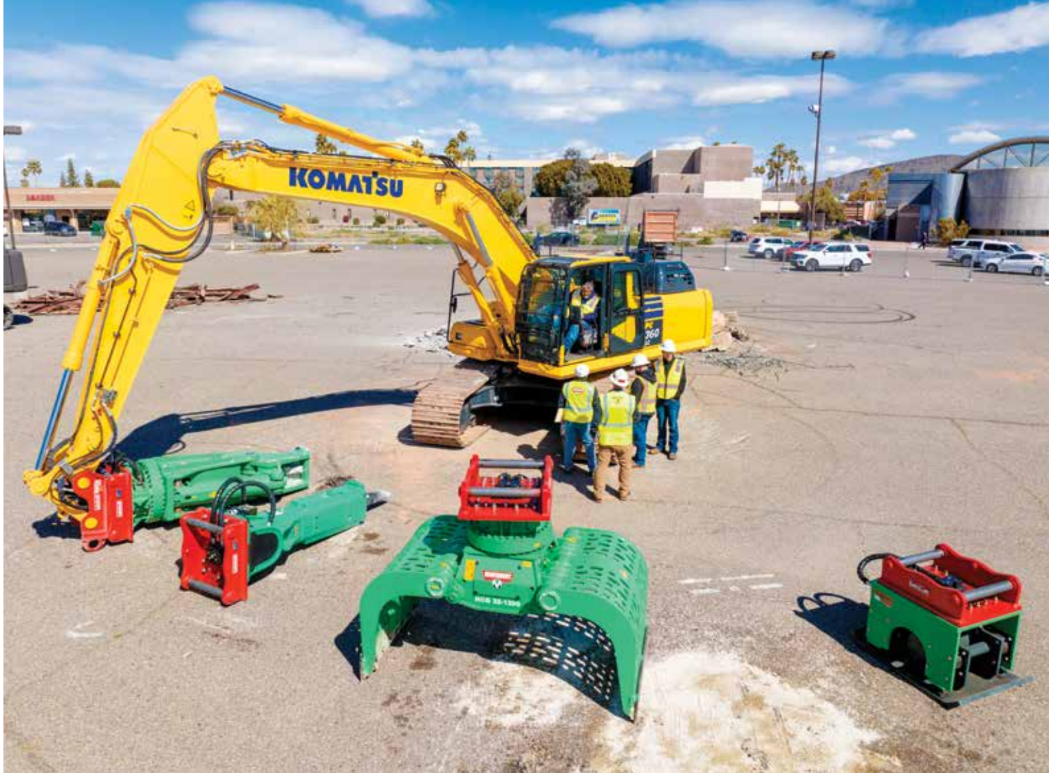
Montabert and Komatsu employees speak to attendees about the new Lehnhoff SQ80V fully hydraulic symmetric quick coupler system outfitted on a Komatsu PC360LC-11 excavator.

Manager, Komatsu. "The machine is fully guarded to protect vital machine components and helps keep the operator protected while working in harsh environments. The WA475 also has great bucket capacity. It can handle large quantities of material or switch to a trash grapple and clamp down on oversized and odd-shaped material."